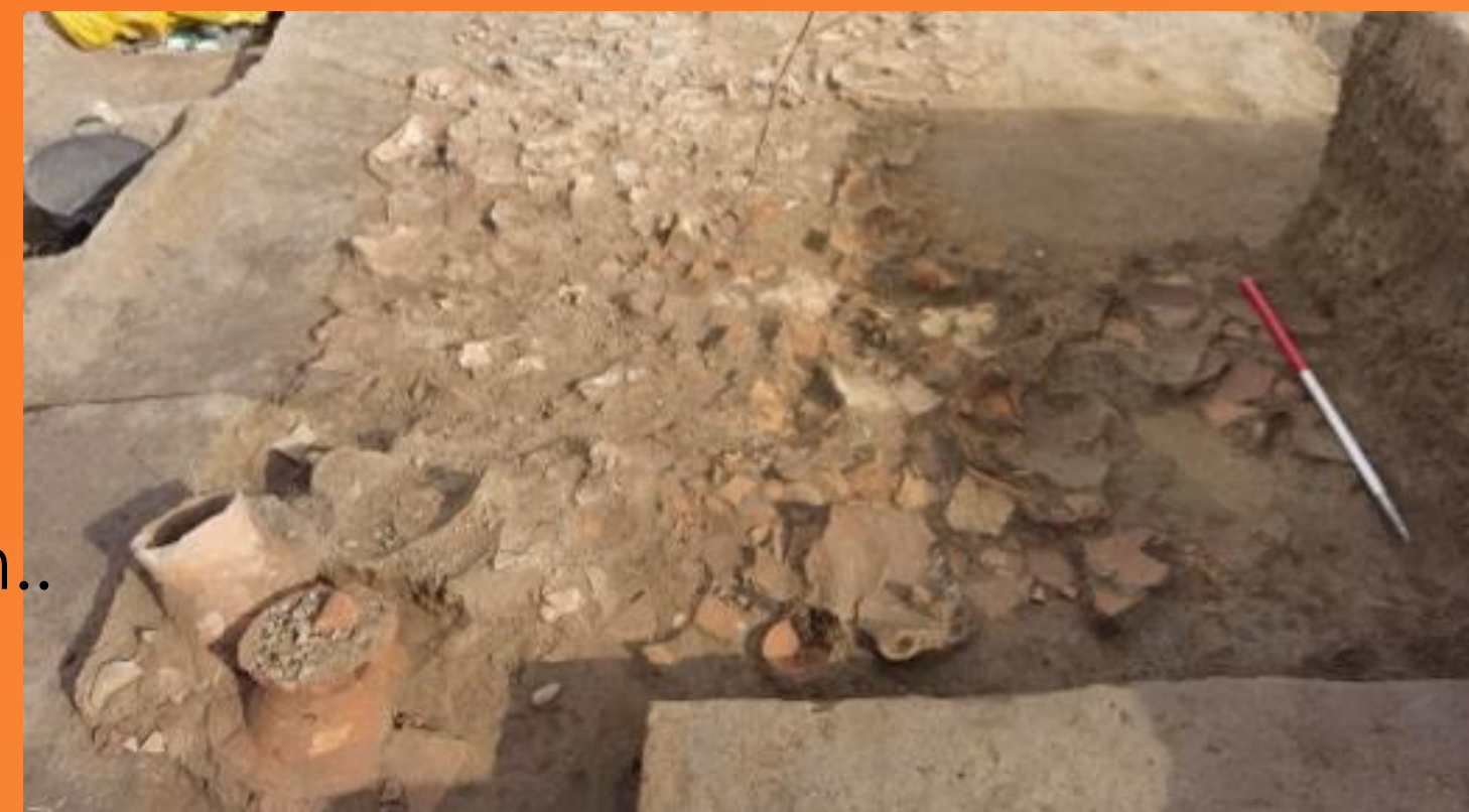
Fig. 1 Pottery layer In main Storeroom..

Excavations at Sais found a layer of smashed pottery, which has been excavated and reconstructed. The material formed part of the foundations of a large wall of the late New Kingdom, built upon late Ramesside Storage structures.