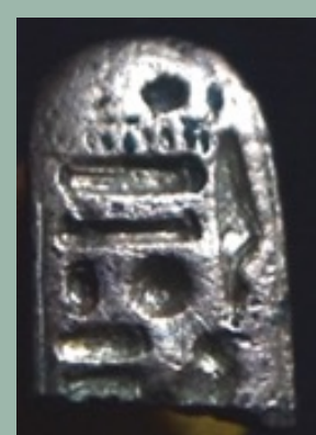
Ring bezel and scarab with name of the god Amun