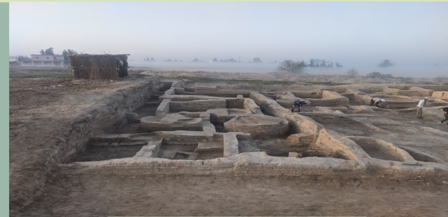
Storage Area in the barracks