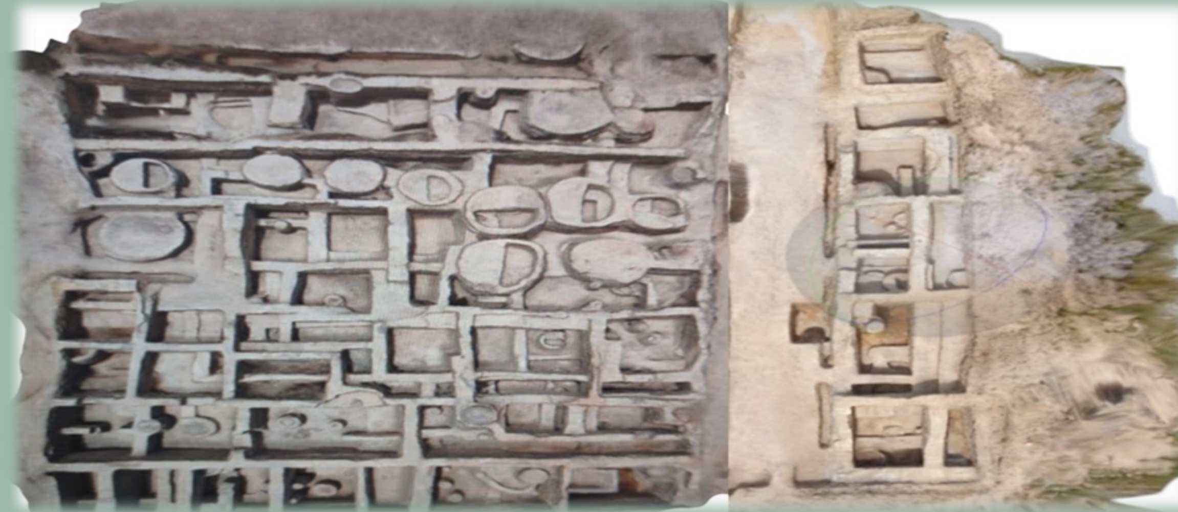
Military barracks area in the southwestern corner of the Fortress at Tell El- Abqa'in