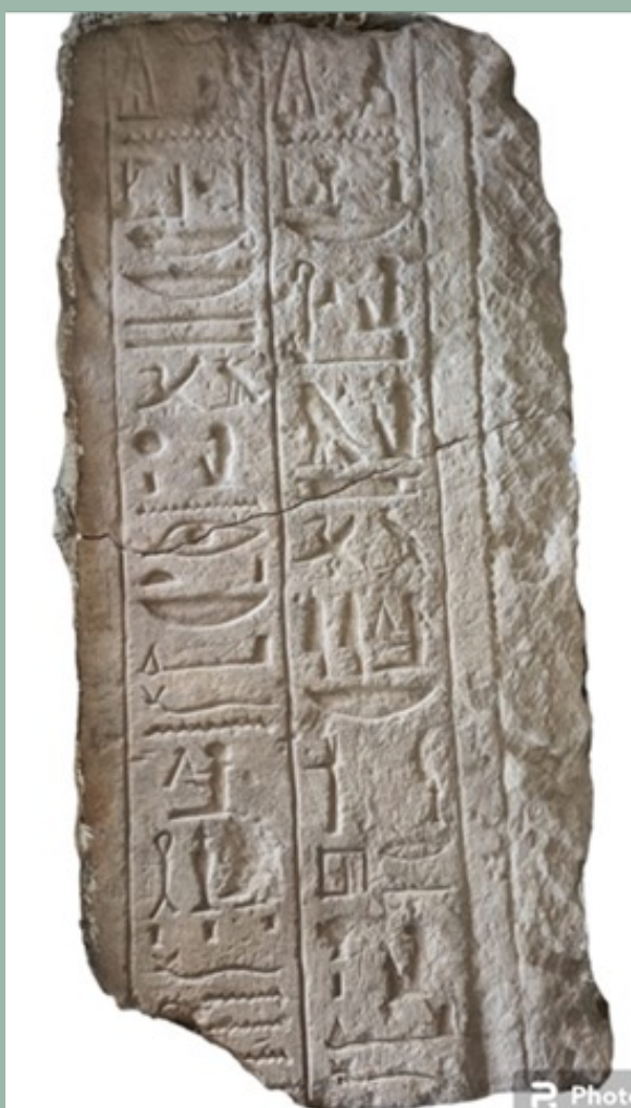
Door jamb with offering text