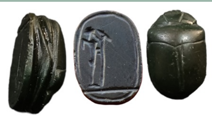
Stone scarab with the god Ptah

Thanks to all of the members of the Tell El-Abqa'in Mission