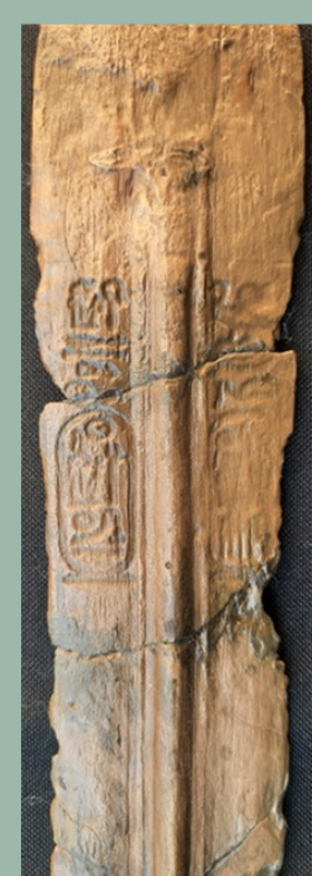
Sword blade with name of Rameses II