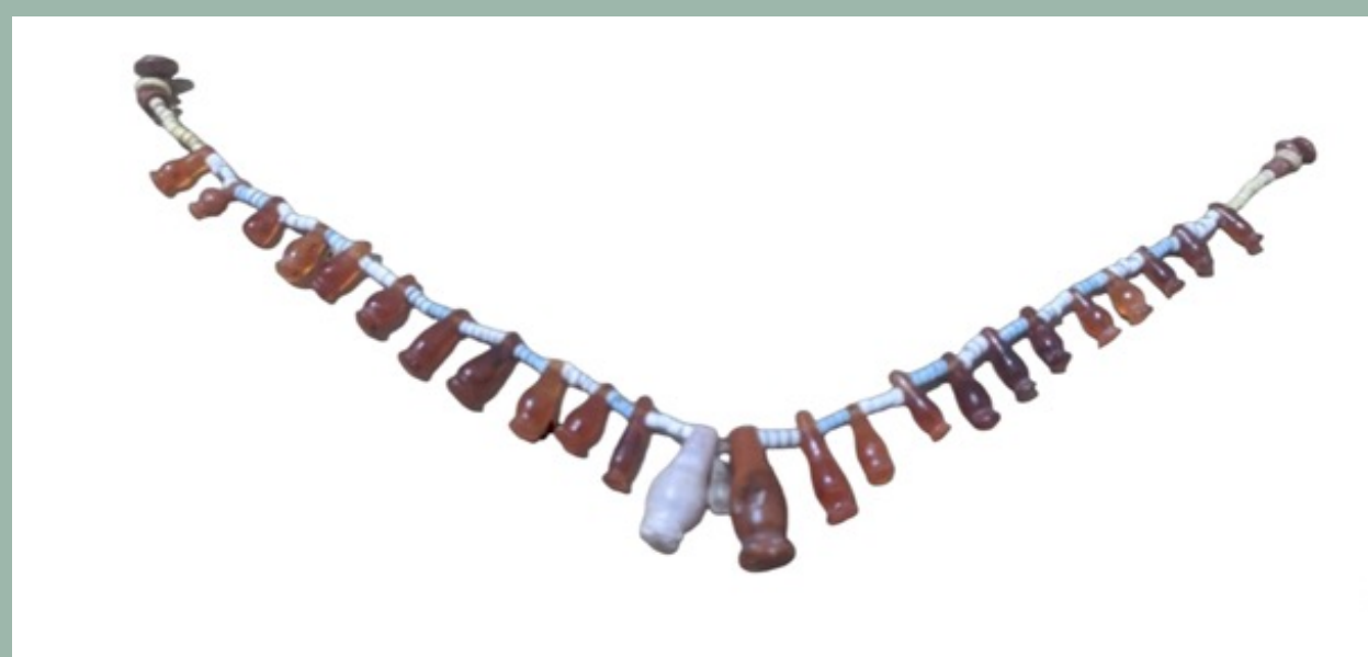
Necklace of red agate and faience