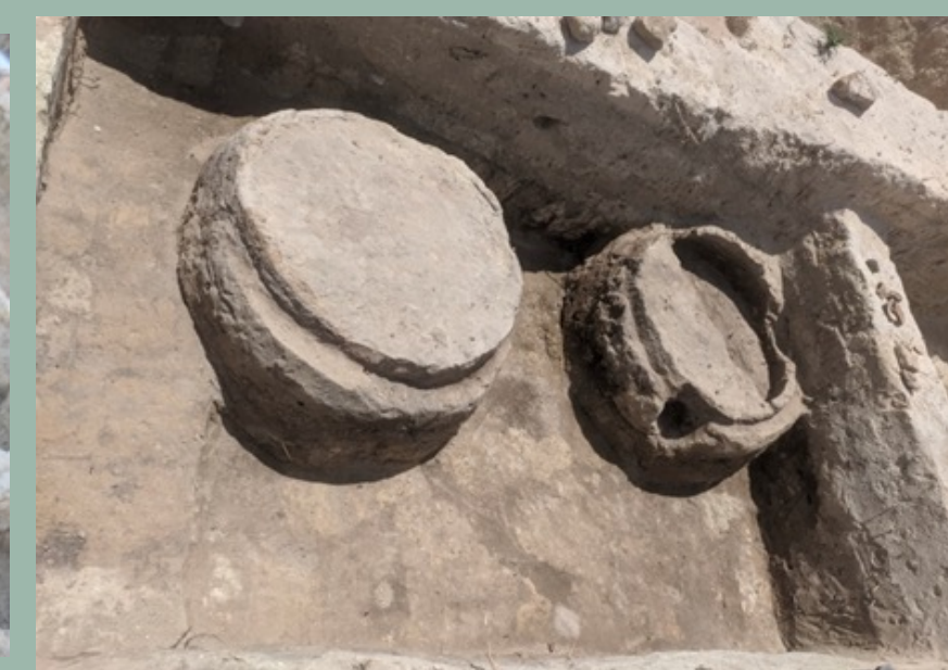
Silos (left) and Ovens (above)