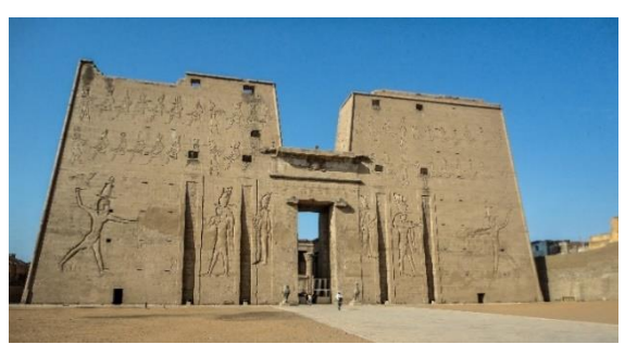
<u>Pylon</u>: a monumental gateway, originally with flagpoles outside.