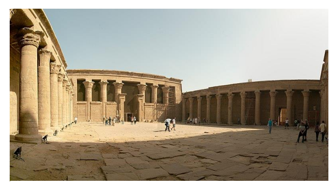
Open court: a roofless courtyard, also called the 'festival court'.

<u>Hypostyle hall</u>: a roofed space filled with columns, often in the shape of papyrus plants.