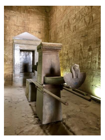
<u>Sanctuary</u>: where the god's statue was kept in its shrine.