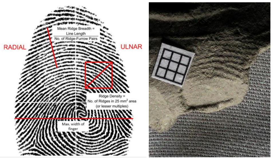
Left: Example of a fingerprint and the three measurements used in archaeology and in this study. Right: fingerprint left by an administrative in a clay seal from Abydos (Egypt), ca. 3000BC.