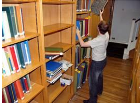
Thomas Booker in the midst of moving thousands of books in order to create new shelf space in the Society's Caminos Library.

The budget for purchasing new material for the library continues to be bolstered by the proceeds from second hand book sales, however, acquiring large numbers of books to add to the steady trickle that we acquire continually through exchange and gifts from colleagues etc. had become impossible in recent months as shelf space had almost completely run out. During September a series of bookcases on the ground floor were reorganised by Thomas Booker resulting in the addition of fourteen new shelves' worth of space. Since then we have purchased a great number of new books all of which have now been catalogued and are available for consultation. A full list of titles acquired in the last few months is now available here .