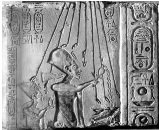
Relief showing Akhenaten and Nefertiti discovered by the Society in 1926-7.

The Society's latest newsletter, ' News & Events Autumn / Winter 2010-11 ' has now been dispatched to members and contains details of a study day on recent research into the Amarna Period to be held on 11 December. The Society has had a long association with the Amarna Period and in particular with the capital city of the time, and the last year has seen extensive new excavations in the Valley of the Kings, and the publication of a book alleging that the famous Berlin head of Nefertiti is a fake, while DNA analysis of a series of Royal Mummies has led to new claims about the relationships between the various famous personages. Our aim in organising this event is to provide a critical response to the recent work and to assess the current state of our knowledge of the period.