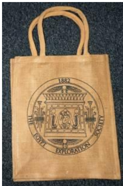
One of the new EES jute bags

Those who attended the Third British Egyptology Congress (See EA 37, p. 4) will know that the Society is now selling EES-branded jute bags. They are stylish and certainly practical – we found them to be an excellent means of transporting books to Manchester from London for the EES North event on 23 October! – and they also serve as an excellent advert for the Society! The bags are on sale for £5 (plus postage & packing): to place an order please contact Steve ( steve.partridge@ees.ac.uk ) or pick one up next time you visit Doughty Mews.