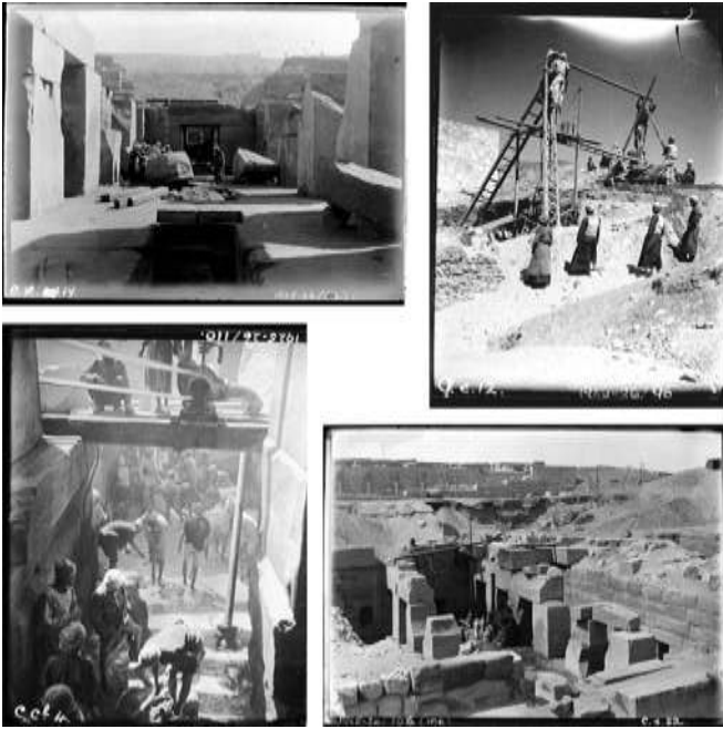
Selection of photographs taken during the Society's work at the Osireion in 1925 and now kept in the Lucy Gura Archive

We are very much looking forward to the next few months during which we expect to see further developments in our research and publications programmes, more progress made with the project to improve our archive facilities, and some successful events in London and elsewhere. We believe this is a very exciting time for the Society and hope you share this view!