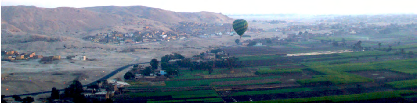
Looking northwards to the hills of Dra Abu el-Naga.