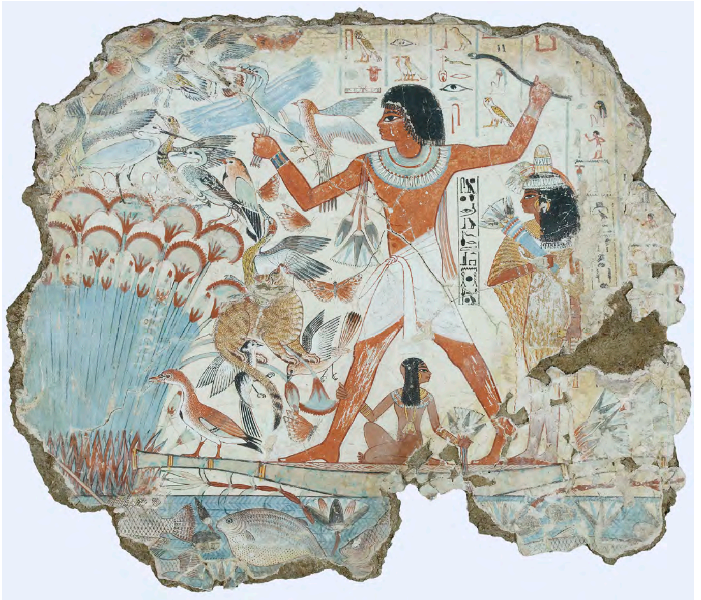
The famous scene of Nebamun hunting in the marshes, with two details of the wildlife surrounding him: a Plain Tiger butterfly and a flying bird