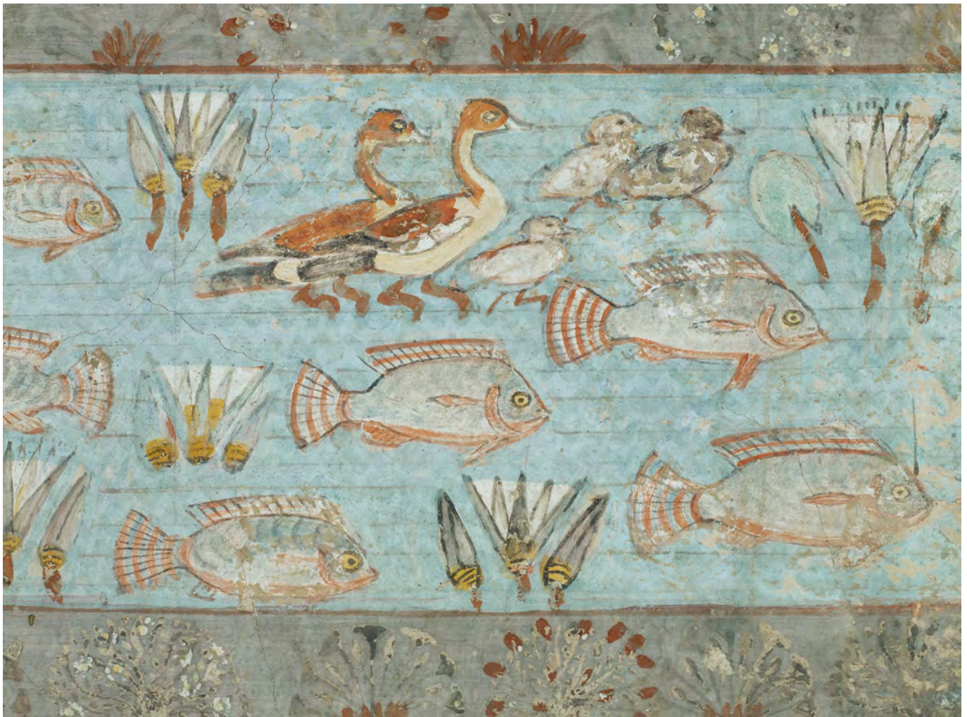
Detail of the scene showing Nebamun's 'garden of the west': a pool full of fowl and Tilapia fish