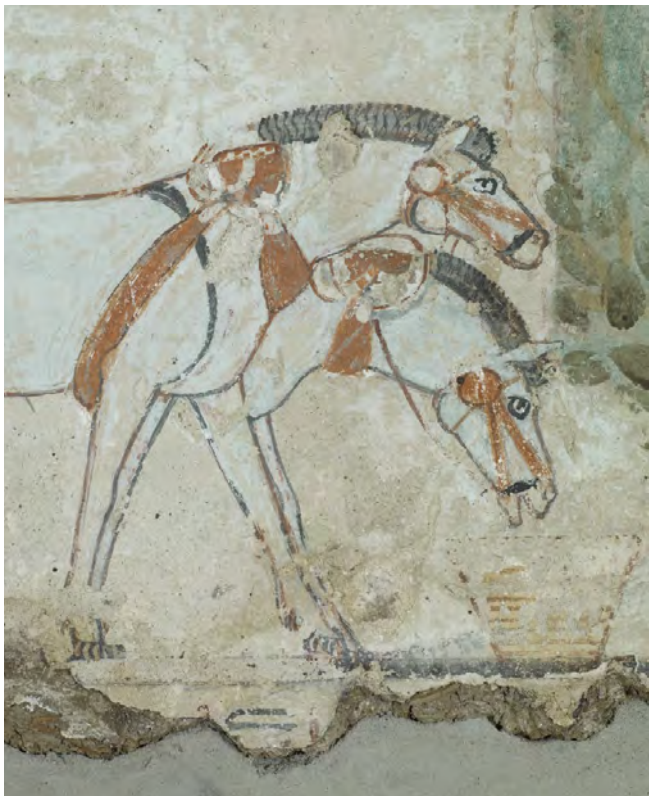
A detail of an agricultural scene, showing two hinnies (offspring of a male horse and a female donkey) eating under a sycamore tree

of some 150 contemporaneous artefacts will suggest to the visitor the intense realism of these paintings, but the artefacts will also remind visitors that these scenes present an idealised world-view of a small elite, and that most people's experience of life was not necessarily the celebration of leisure and prestige that the eternally young Nebamun enjoys.